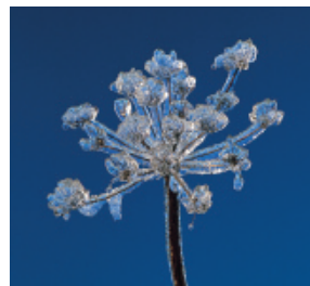
Umbellifer in ice