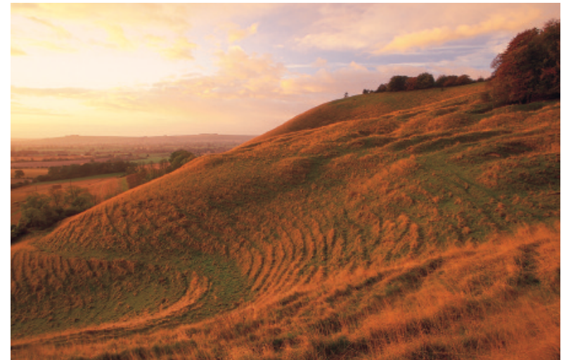
Pewsey Vale from Martinsell Hill