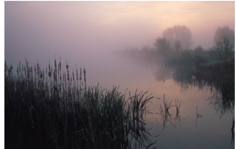
Shrouded in mist