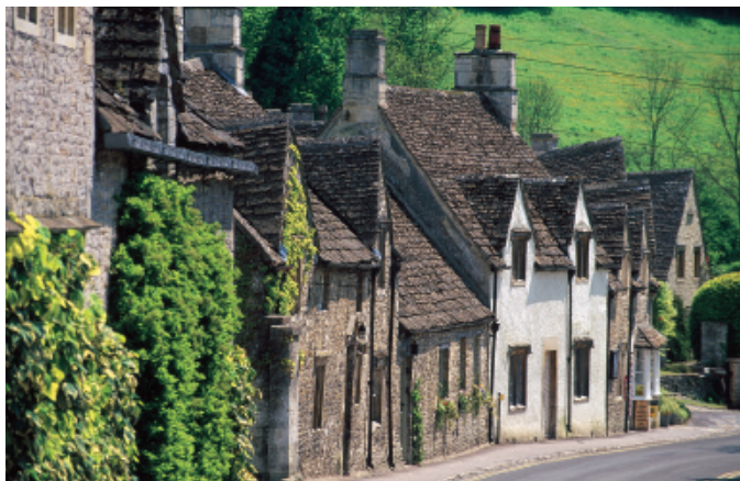
Harmony at Castle Combe